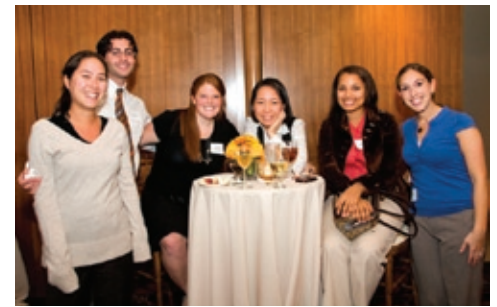
Housestaff enjoy cocktail reception.