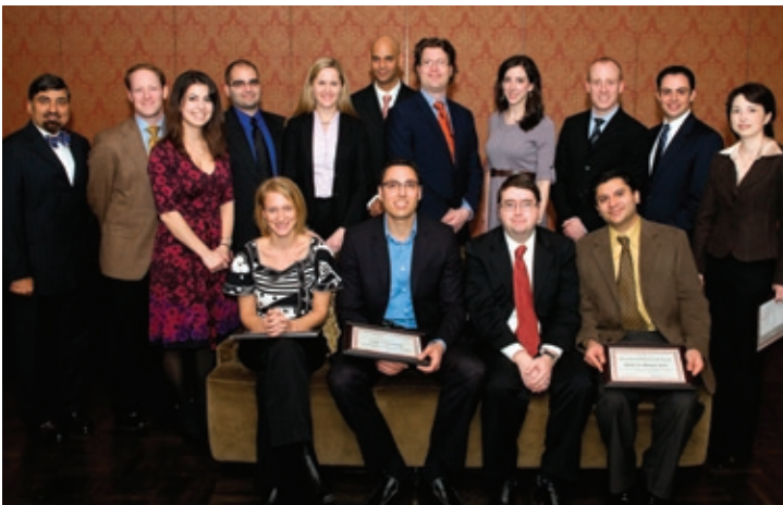
2008 Distinguished Housestaff Award Recipients

The Distinguished Housestaff Award was presented to a member of the housestaff from each department. This year 22 awards were presented. Our 13 new Medical Center Circle members were also recognized and presented with certificates during the dinner.