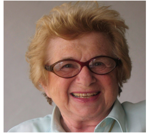
Dr. Ruth Westheimer

All CAC members will be invited to attend. Space is limited, so advance registration will be required. To ensure you receive an invitation to this event, renew your membership or join the CAC today! Be on the lookout for your invitation in February.