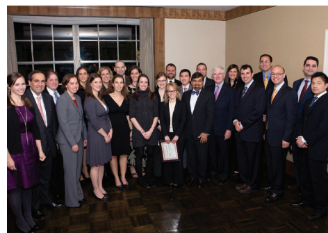
2009 Distinguished Housestaff Award Recipients