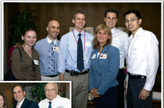
Guests from Rehabilitation Medicine

The Membership Committee continually explores ways to engage members of the CAC in its activities and increase awareness of the CAC in the Medical Center as a whole. The Housestaff Welcome Reception gives us one such opportunity. The Second Annual Housestaff Welcome Reception was held on September 17, 2009 in the Griffis Faculty Club. Department Chairs, Residency Program Directors and Coordinators and Housestaff Quality Council members united with the CAC Board of Trustees to interact with the new residents and welcome them to our Medical Center.