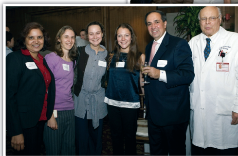
Guests from Obstetrics & Gynecology