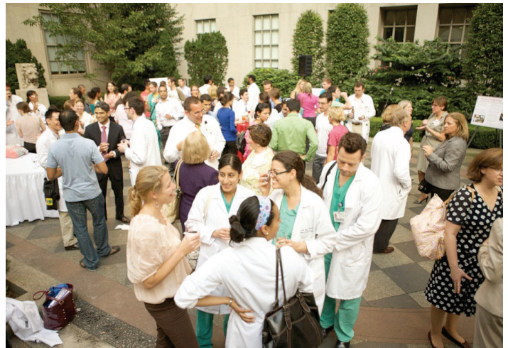
Housestaff enjoy reception in the Harkness Courtyard