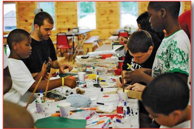
Pediatric burn survivors and volunteer WCMC student counselors enjoy Camp Phoenix program activities.

Camp Phoenix is a tuition-free camp that, since 2000, has been run by volunteer Weill Cornell Medical College students under the supervision of volunteer nurses and physicians. This program, which annually serves approximately 150 former patients of the William Randolph Hearst Burn Center, is a valuable experience that allows burn patients to challenge themselves, build self-confidence and heal emotionally by building friendships, sharing team building activities and simply having fun with other burn survivors. In addition, while serving as counselors, medical students learn about burn medicine and gain experience in and insight into, providing compassionate care to young patients.