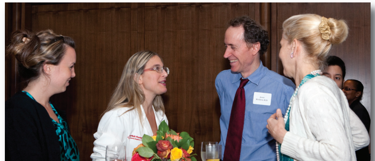
CAC members enjoy the cocktail reception