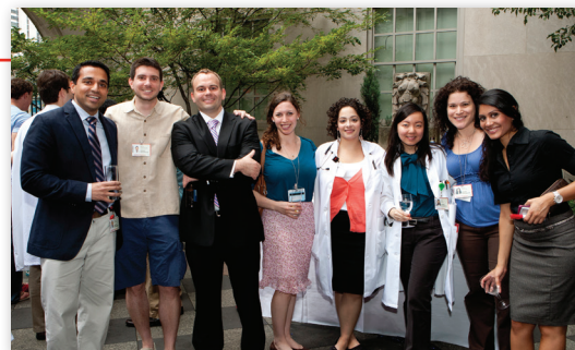
Residents enjoy the 2012 Housestaff Quality Council Welcome Reception

Thursday, September 26, 2013 6:00 p.m. Presentation in Uris Auditorium 7:00 p.m. Reception in Griffis Faculty Club